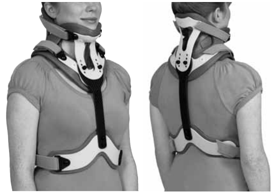
CV100 and CV102 shown